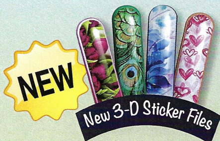
New 3-D Sticker Files

Available in a variety of sizes, solid colors, two-toned, clear, and painted designs.