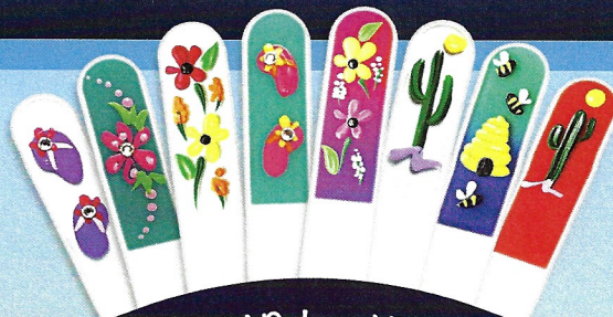
Our Original Beloved Painted Files

Available in a variety of sizes, solid colors, two-toned, clear, and painted designs.