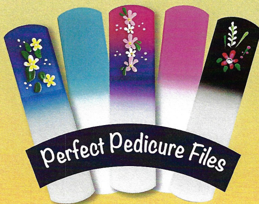
Perfect Pedicure Files

Protect your investment with a slim, chic case in a variety of stylish colors.