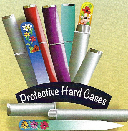
Protective Hard Cases

Protect your investment with a slim, chic case in a variety of stylish colors.